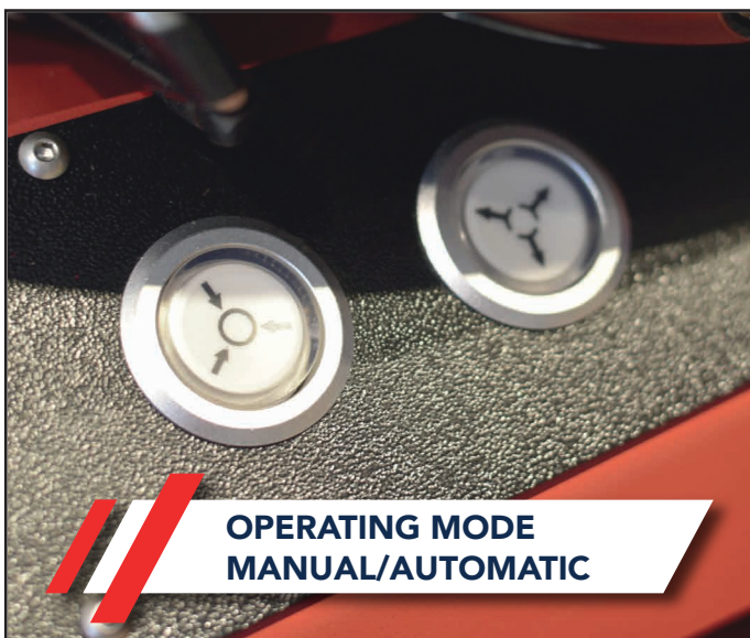
OPERATING MODE MANUAL/AUTOMATIC