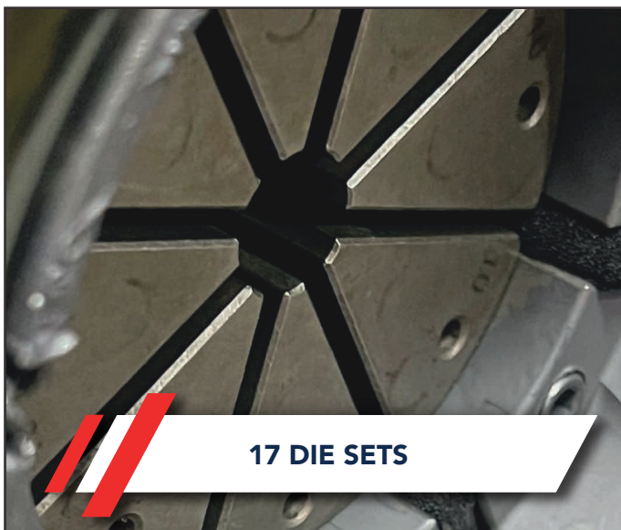
17 DIE SETS