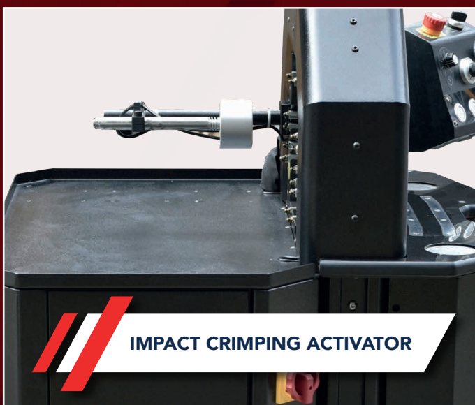
IMPACT CRIMPING ACTIVATOR