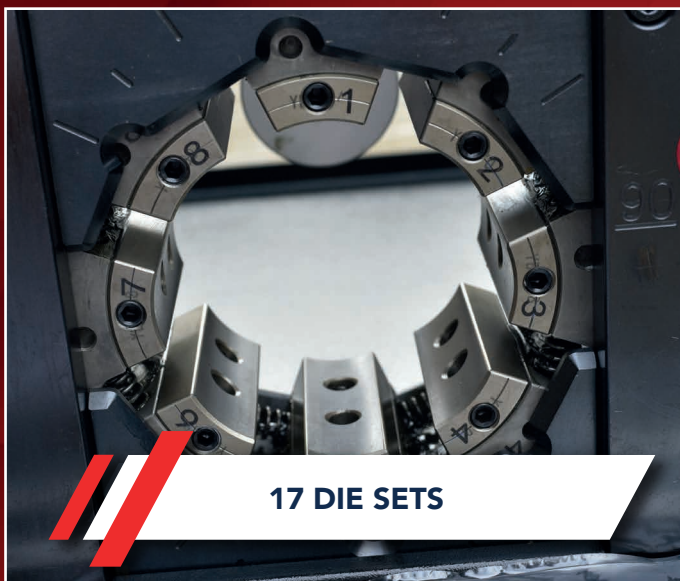
17 DIE SETS