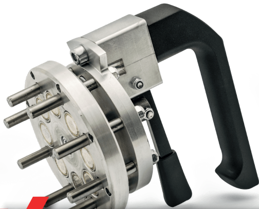
QUICK CHANGE TOOL