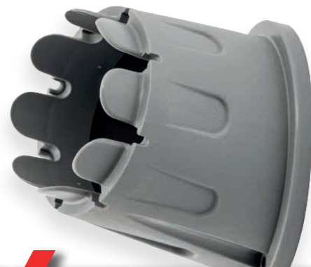
DIE SET SLOT