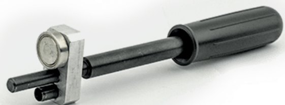
SINGLE DIE CHANGE TOOL