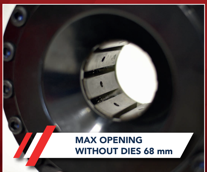
MAX OPENING WITHOUT DIES 68 mm