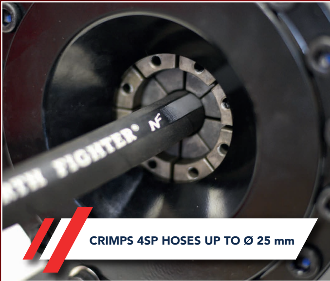
CRIMPS 4SP HOSES UP TO Ø 25 mm