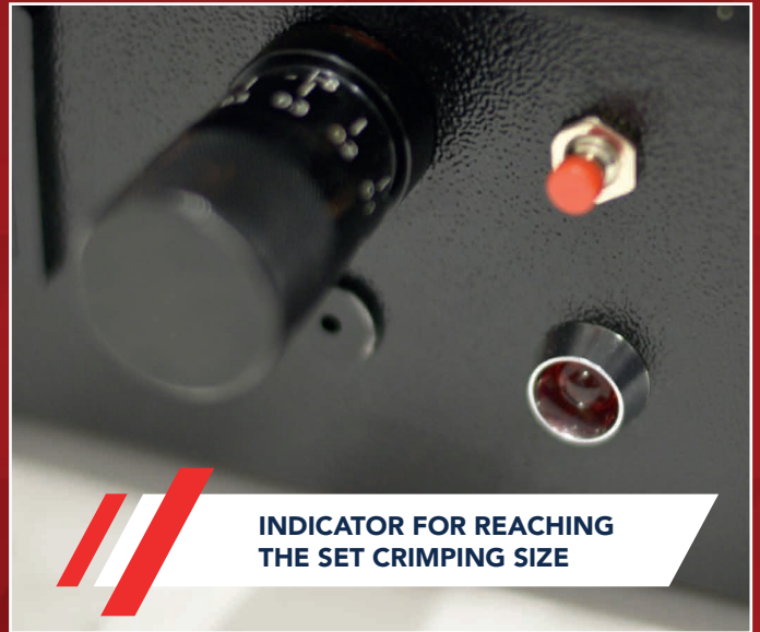
INDICATOR FOR REACHING THE SET CRIMPING SIZE