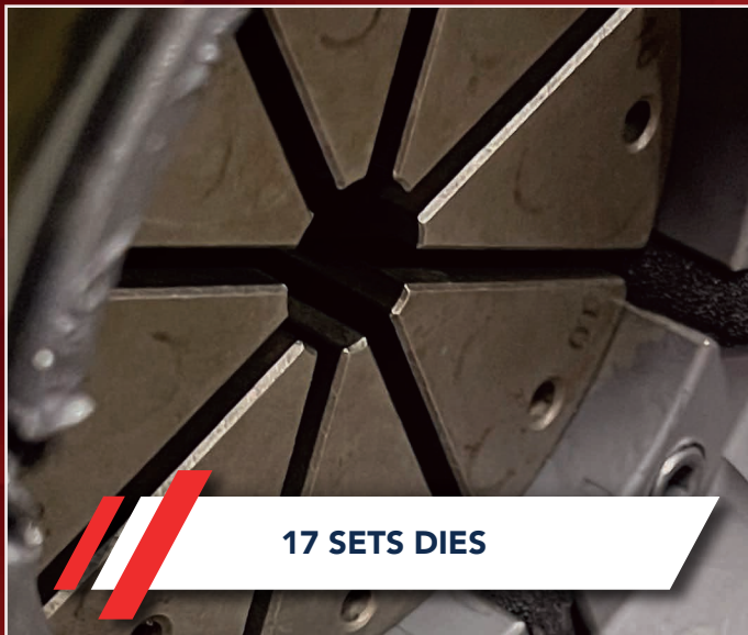
17 SETS DIES