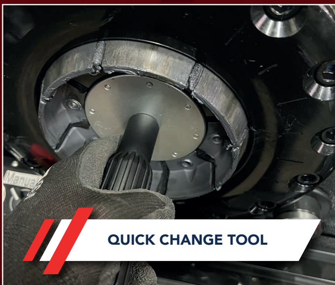
QUICK CHANGE TOOL