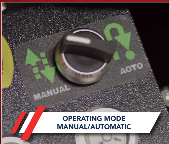
OPERATING MODE MANUAL/AUTOMATIC